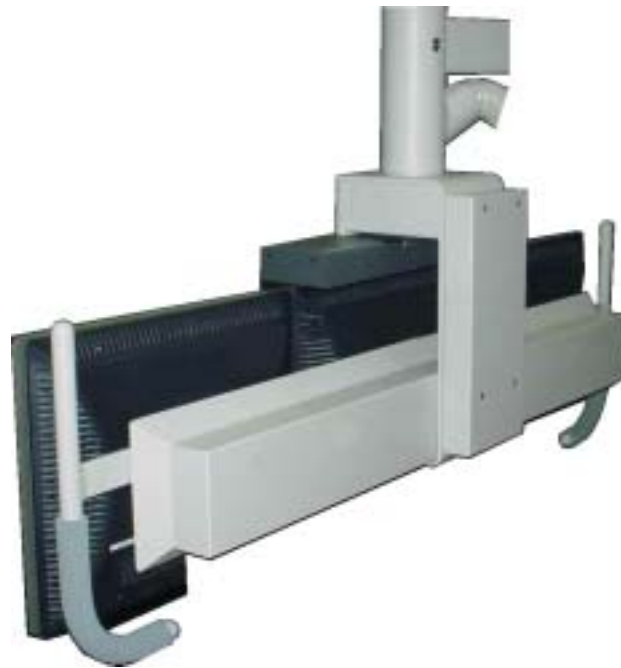
FULLY ENCLOSED CABLE ROUTING