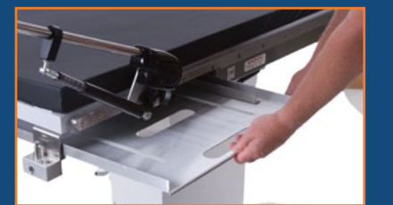
Removable radiographic cassette tray: loads from either side of table. Accepts cassette with grid cap or mobile DR detector.