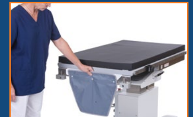
Removable lead-vinyl x-ray shield