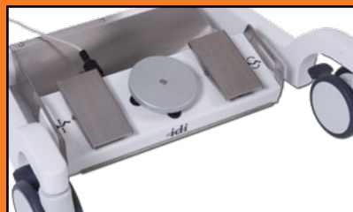
Built-in footswitch storage tray