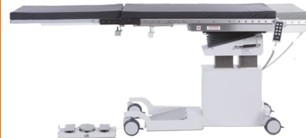
Longitudinal tabletop travel: 10"