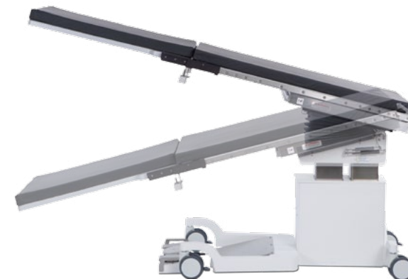
Trendelenburg: \pm 15^\circ