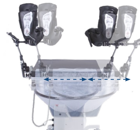
Transverse travel: \pm 3.5" , 7" total