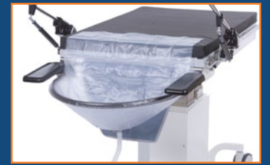
Removable, collapsible drain bag support (elbow rests are optional)