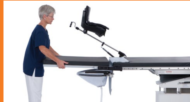
Lightweight, radiolucent tabletop extension