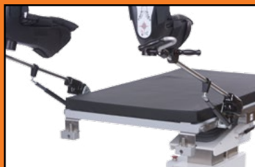
Metal-free perineal end of table: unobstructed imaging access to edge of tabletop.