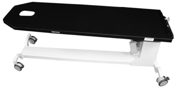
(Table shown with optional tabletop with facial cutout)