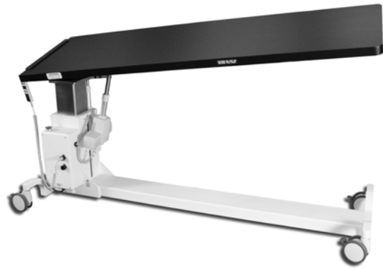
(Table shown with standard rectangular tabletop)