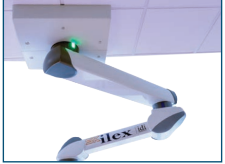
Reduce cable clutter & simplify your setup