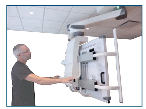
Easy monitor positioning