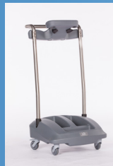
ComfortFin Storage Cart C100-3044