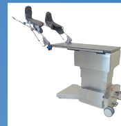
ComfortFin 350 stirrups shown on IDI Urology table