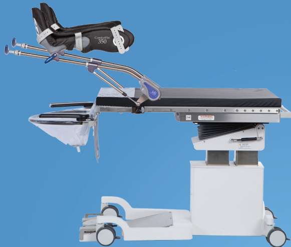
IDI's Aspect 100UCPlus The industry's best-selling urology table A100-1517