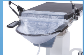
Drain Bags Case of 20 C000-0593

Order package A100-2521 for the Aspect 100UCPlus package with ComfortFin 350 Stirrups Order package A100-3107 for the Aspect 100UCPlus package with ComfortFin 500 Stirrups