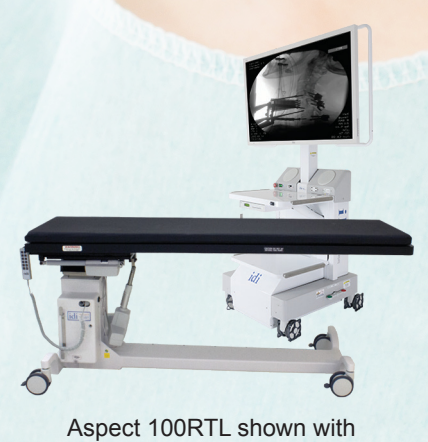
Aspect 100RTL shown with IDI's ilex video integration system

IDI is committed to superior product design, value and customer support in everything we do.