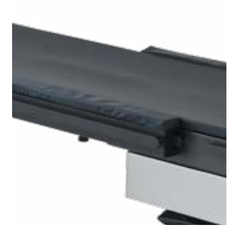
Width extension 24"/600mm x 2"/50mm