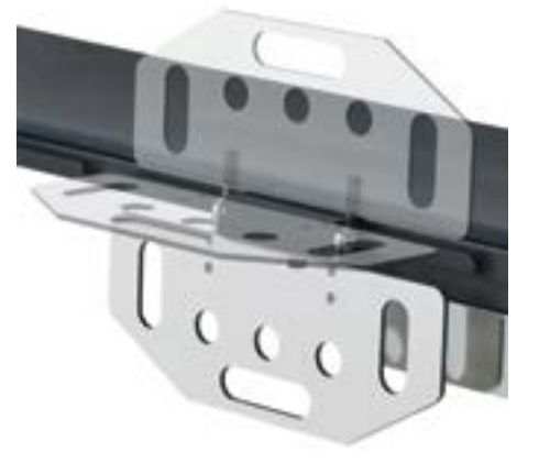
Multi-position arm support