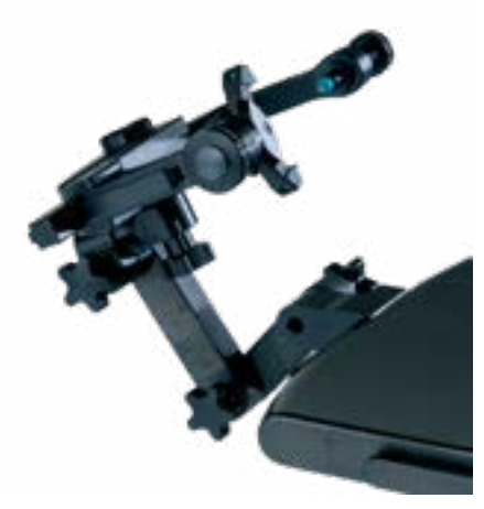
Radiolucent skull clamp