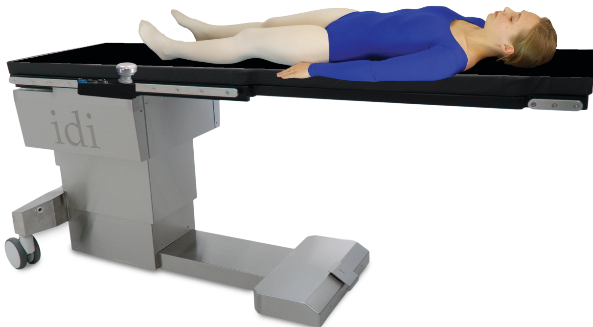
Table and Accessories Catalog